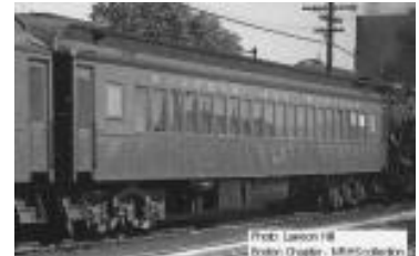
DP-3803A N&W PG Coach #1652