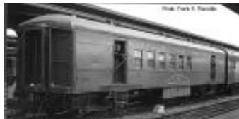
DP-3800 N&W RPO