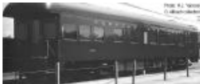
DP-3805A N&W Business Car #101,102