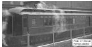
DP-3802 N&W Bpd Baggage/Coach Car