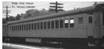
DP-3803C N&W PG Coach #1647