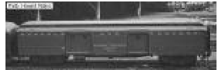
DP-3801 N&W BEj Baggage/Express car